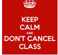
Don't Cancel Class