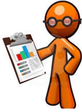
Computer Lab Data