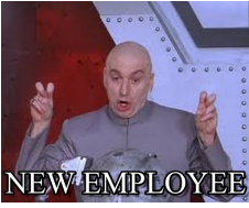
New Employee Introduction