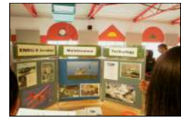
ENMU-Roswell Aviation Maintenance