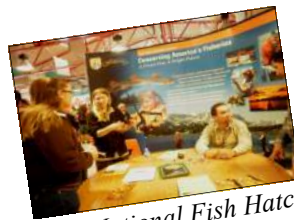
Dexter National Fish Hatchery