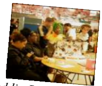
Aladdin Beauty College