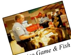
New Mexico Game & Fish Dept.