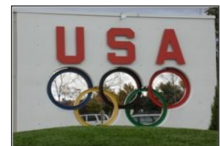
U.S. Olympic Training Center

In order to qualify for consideration to attend GEAR UP Summer Academy, GEAR UP students must have at least a "C" average in all classes.