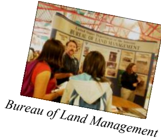
Bureau of Land Management