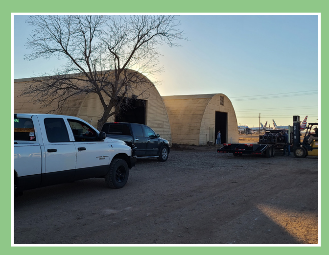
Large Quonset Huts