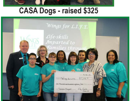
Wings for Life - raised $1,118