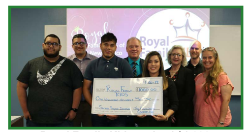
Royal Family Kids - raised $1,000