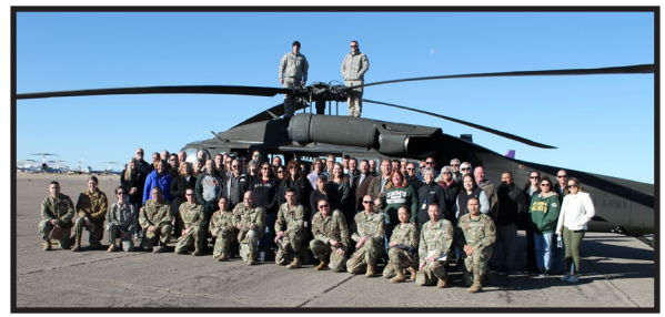
Roswell employers are given the opportunity to ride in a Black Hawk helicopter during the bosslift.