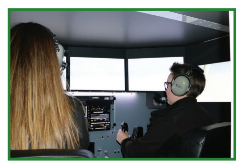
Pilot Training Simulator