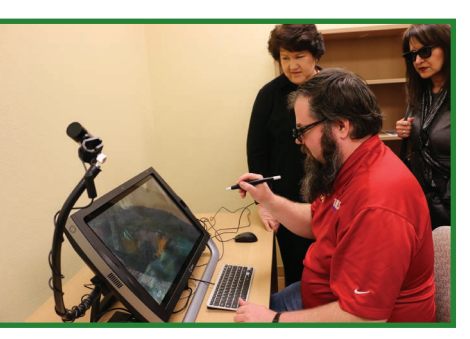
zSpace Simulation Center