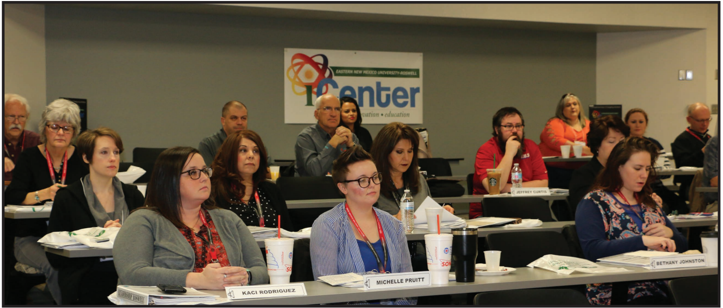
Leadership Roswell participants listen in the iCenter seminar room before they gather for a campus tour

On February 9th, the Leadership Roswell class was able to experience the "real life" simulation equipment on campus which included the pilot training simulator in the Aviation Department, the Regional Medical Simulation Center and the the CDL simulator.