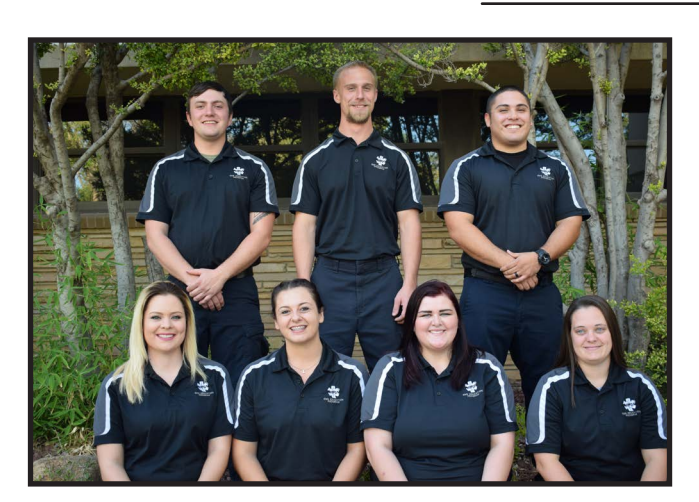
2017 Summer Paramedic Graduates

Eastern New Mexico University-Roswell's EMS Education Program's 52nd Paramedic Class graduated on July 28, 2017. These students spent 14 months of intense training in advanced patient assessment, pharmacology, and management of acute emergencies. Students spent approximately 600 hours in the classroom, 450 hours in clinical rotations, and 225 hours in internship.