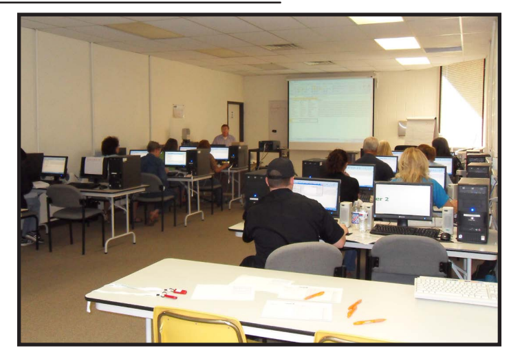
Classroom setting for a CWCD training.

There are several projects that the CWCD office is working on at the moment. They just finished up the youth Aviation Camp, which was a big hit with high school students. They will soon offer a National Registry Exam for EMT's and paramedics on July 29th. Also offered are computer classes at the Senior Circle, Spanish for ENMMC health care workers, Youth ChalleNGe educational classes, RISD dossier training, NMDA