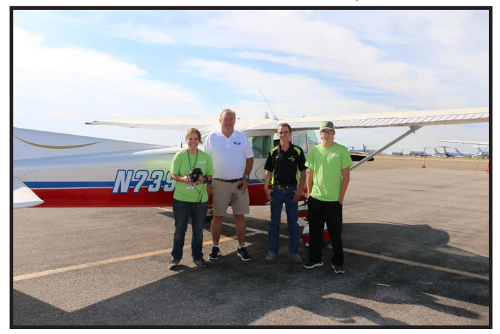
Students and flight instructors get ready to take flight in two Cessna 172 airplanes.

The studnts received their own log books with their flight time after flying a Cessna 172. They ended the camp with a graduation ceremony receiving a certificate for attending the camp. For more information about the Aviation Camp, contact Vickie Thomas at vickie.thomas@roswell.enmu.edu.