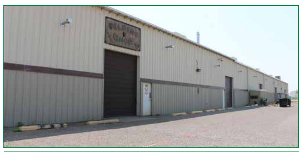
Bond funds will be used for needed renovations to create a state-of-the-art Automotive and Welding Technology facility on the south end of campus.

For many of New Mexico's colleges and universities, including ENMU-Roswell, GO Bond D is the only source of funding that allows us to re-invest and modernize facilities we already have, improve safety and technology, and boost degree and certificate programs that give our students the knowledge and