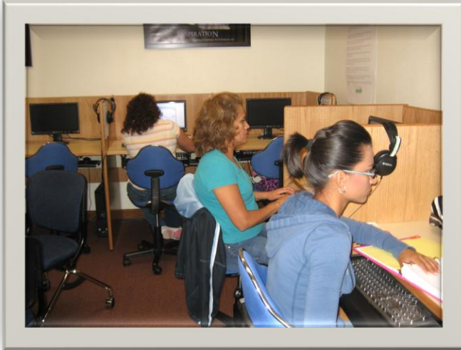
English Language Learner Lab